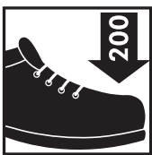
Product features 200J toe cap