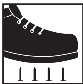
Product features reinforced midsole